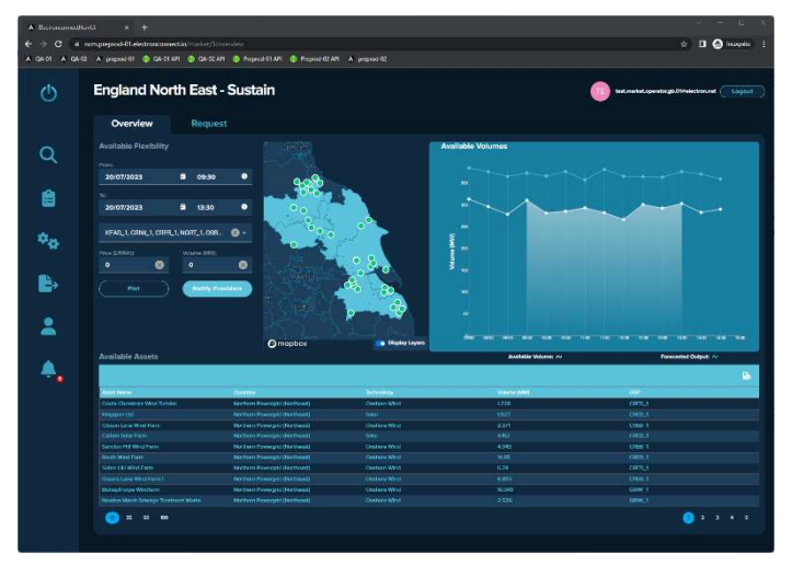
Figure 1. ElectronConnect Platform.

ElectronConnect supports a range of trading arrangements (e.g. payment types, matching and