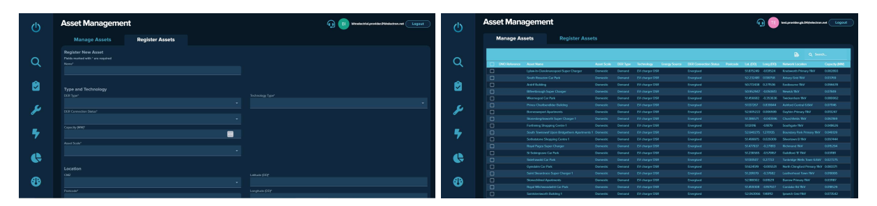
Figure 5. BiTraDER Platform Asset Registration.

each participant. The project team anticipates a total of 40 assets to be registered throughout the simulation trials.